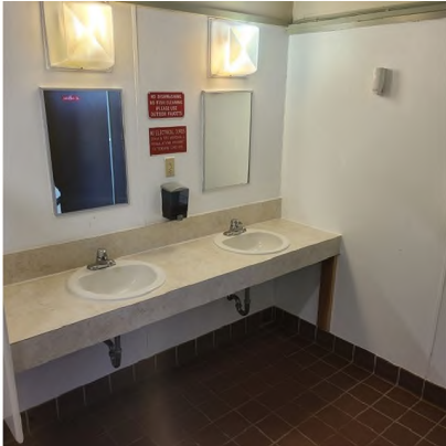
Newly Installed Restroom Sink Counter

Two restroom sink counters that were worn and water damaged were replaced this season by our seasonal Park Ranger. Water was leaking from around the sinks and the Formica laminate sheeting was peeling, which made them difficult to clean and unsightly for visitors. Our Park Ranger purchased all the materials needed and cut and replaced the two sink counters which not only made them easier to clean it also improved the appearance.