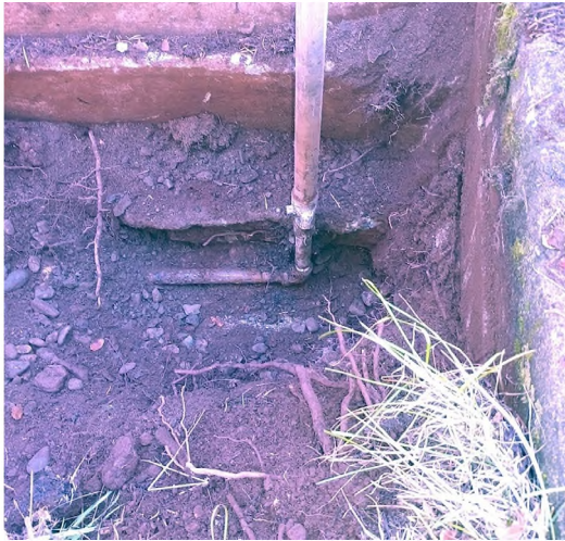
Broken Water Line in Hyatt Lake Campground

In 2023, Hyatt Lake Recreation Area will be closed for utility upgrades. Great American Outdoors Act funding has been secured to replace the water, wastewater, and electric lines in the Hyatt Lake Recreation Area. While the campgrounds are closed we are planning to do more work on meeting the International Dark Sky Association's requirements so that we can apply for a Dark Sky designation for portions of the Cascade-Siskiyou National Monument, which would include the Hyatt Lake Recreation Area. In particular, we will be looking at the lighting in the campgrounds and how we can change the lighting to meet Dark Sky requirements.