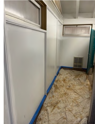
Painting Interior of Restroom

For the 2022 camping season, we had two couples for campground hosts that went above and beyond in their duties. Not only did they keep the campground tidy and restrooms cleaned for campers, they also took on a lot of painting. During the season the campground hosts painted the interior of three restrooms and painted all the picnic tables in the Mountain View Shelter and Osprey Kitchen, 19 in total. Their hard work and dedication were noticed by campers who left notes and online reviews.