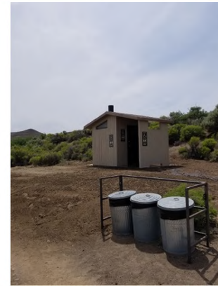
Frog Springs Vault Toilet

To increase efficiency of Recreation Program operations, the Burns BLM has contracted recreation site vault toilet pumping services. Collected recreation fees supported servicing at all 32 district vault toilets. Recreation site vault toilets are now maintained on a schedule, instead of on an as needed basis, providing for improved visitor experiences.