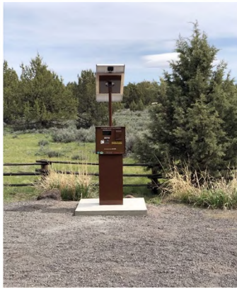
ROK (Remote Off-Grid Kiosk)

The Burns District was selected to pilot the remote off-grid kiosk (ROK). The ROK allows visitors to pay recreation site use fees on site using credit or debit cards. The ROK was installed in May 2022 and shut down for the season in November. During this time, 14.7% of campground funds were collected from the ROK. In Fiscal Year 2023, the ROK will be moved to Fish Lake Campground, a higher use site.