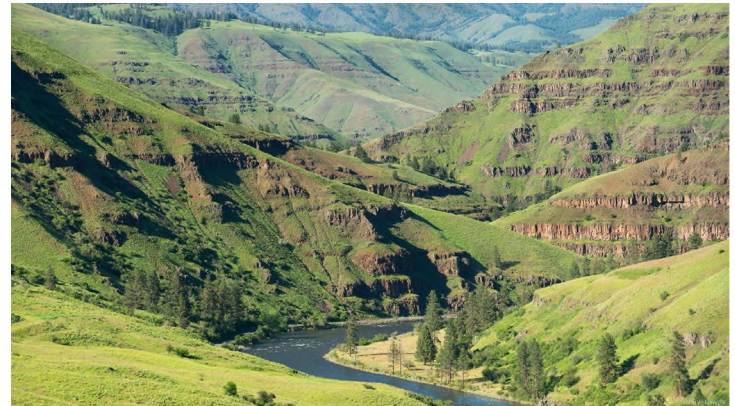
Mud Creek Boat Launch Improvements

Mud Creek is a popular boat launch on the Wallowa & Grande Ronde River near the boundary to BLM lands. The BLM cooperates with the State of Oregon and the USDA Forest Service to manage this 58-mile stretch of river operations, which is entirely patrolled by BLM River Rangers. We meet in both spring and fall to communicate ideas and discuss future river projects. We are working to leverage collected recreation fees for future site improvements to the existing river operations facility at Minam.