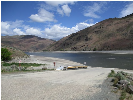
2022 National Public Lands Day (NPLD)

Spring Rec is Baker Field Office's only fee site with 25 campsites, a boat launch, five restrooms, and a fish cleaning station. Spring Rec is located at the south end of the Hells Canyon Recreation Area. Catfish and crappie mixed with largemouth bass make this area a popular fishing destination. Funds generated from Spring Rec's fees are spent on cleaning supplies, toilet paper, trash service, and a camp host. Collected fees also supported a 2022 NPLD with volunteers.