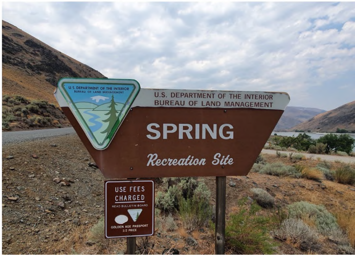
Replace Signs at Recreation Sites on the District

Future planned site improvements include increased patrols and updating our sign inventory. Sign ordering has begun and future plans are to order and replace all of the signs at Spring Rec and on the Wallowa & Grande Ronde River. In 2022, we added a maintenance ranger to our staff, which has given us an extra hand, allowing flexibility to combining forces to accomplish maintenance and improvement projects. The collected recreation fees will also help us support the labor costs for the seasonal River Rangers. We are actively recruiting for a Camp Host in 2023, which is primarily supported by the collected fees as well.