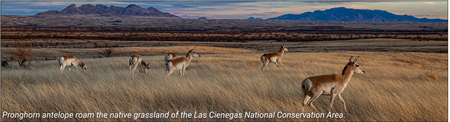
Pronghorn antelope roam the native grassland of the Las Cienegas National Conservation Area.

The Bureau of Land Management is infusing $161 million for ecosystem restoration and resilience on the nation’s public lands, as part of the Biden-Harris Administration’s Investing in America agenda. The proposed work will focus on 21 “Restoration Landscapes” across 11 western states, restoring public lands, strengthening communities and local economies, advancing climate resilience and furthering our commitment to Tribal collaboration and partnership.