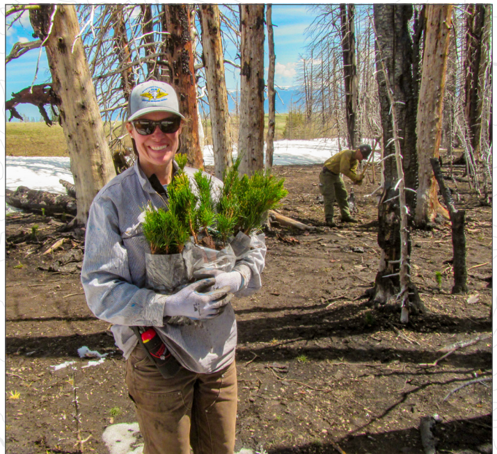
Whitebark Pine planting in the Big Hole area in Montana.