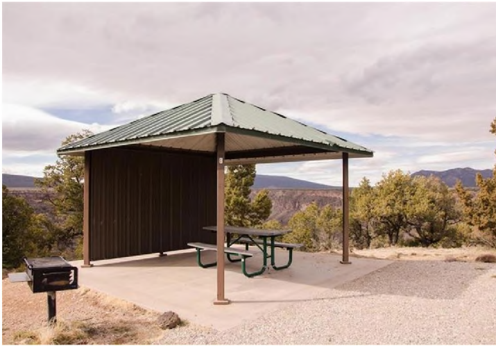
Picnic Shelter at Rio Grande del Norte National Monument