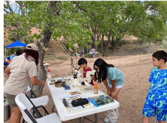
Biology Station at Fall Fish Fiesta

Santa Cruz Lake hosted a public interpretive event earlier this Fall. The event was attended by approximately 65 visitors. Children learned how to cast a fishing rod, saw micro and macroinvertebrates present in Santa Cruz Lake, learned about mammals in New Mexico, talked about boating and fishing safety, and learned about how they could protect the landscape with Leave No Trace principals. BLM partnered with New Mexico State Parks to provide information about the proper use of life jackets.