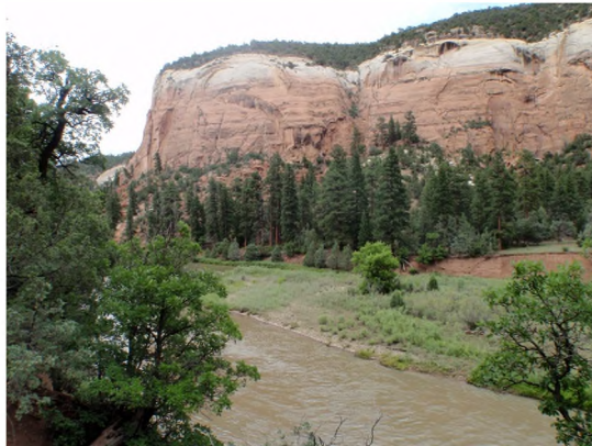
Rio Chama Wild and Scenic River

A Rio Chama camp host spent a second season completing compliance checks on commercial and private river trip launches and controlling congestion at the boat ramps for those launching onto the Rio Chama Wild and Scenic River. Camp host duties included monitoring group size, the number of dogs and number and type of boats for each permit which will be used to help develop future river management plans. This has resulted in cost savings in time and money for the river program.