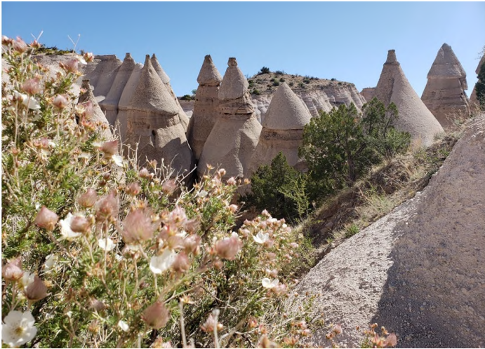
Hoodoos with Apache Plume