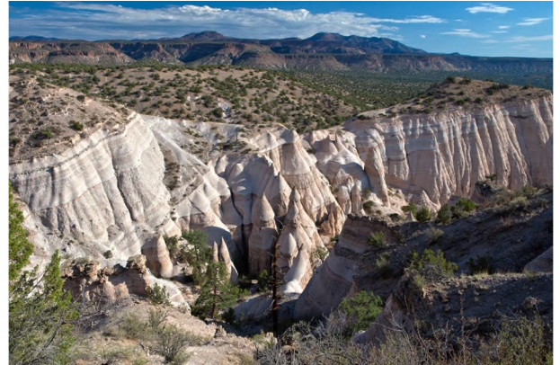
Scenic view of Kasha-Katuwe Tent Rocks Hoodoos

Visitors have been missed at the Monument during the closure. However, the trails, wildlife, vegetation, and landscape has had much needed rest. Upon reopening, visitation will be reduced to allow for a more sustainable recreation experience.