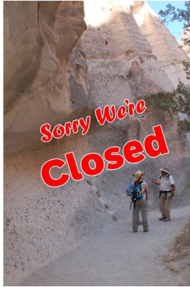
Sorry KKTR Closed

Kasha-Katuwe Tent Rocks National Monument remains closed since March 13, 2020. Access along NM22 is currently limited to Tribal members to reduce COVID-19 exposure to the gateway community of Pueblo de Cochiti. The BLM continues to make efforts in reopening discussions and planning with the Cochiti Pueblo.