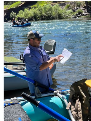
Blackfoot River Float-In Campsite Visit

5 new float-in campsites were established along the Blackfoot River. This complements our State Land Management Partnership and their 5 campsites. Fee revenue was applied to purchase a new raft for monitoring and compliance, as well as additional training and equipment for boat operators. This project gives the public an enhanced recreation opportunity in a highly desirable area otherwise closed to camping.