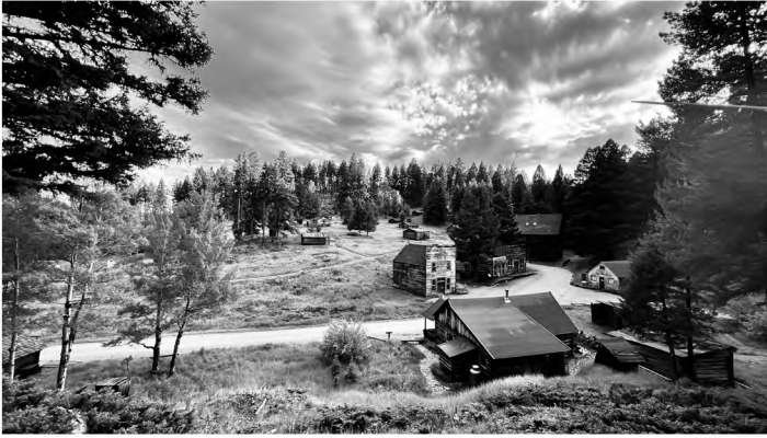
Garnet Ghost Town

Garnet Ghost Town receives over 30,000 visitors from mid-May through mid-October. With decreasing budgets, increasing visitation, and longer visitation seasons the majority of fee revenue will be used to pay for seasonal labor, volunteer reimbursements, and supplies in FY23.