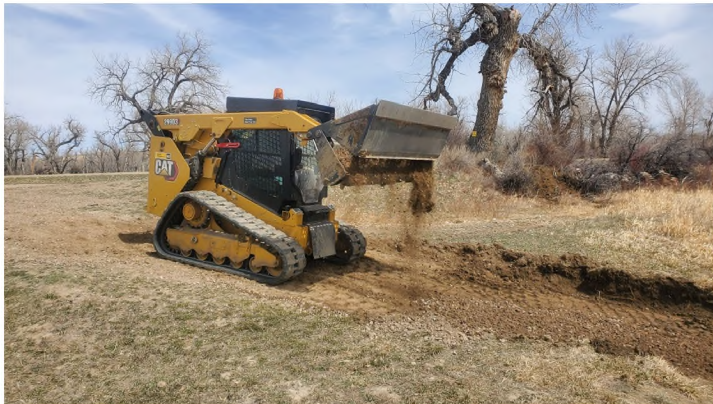
Spreading gravel at Marias River boat launches.

The Malta Field Office (FO) has used funds from 1232 to enhance the Marias River boat launch sites by adding gravel to three of them. In addition, the FO has plans to install new signage, picnic tables, and fire pits at these locations in the near future, further improving the visitor experience. These upgrades will provide a more comfortable and convenient environment for outdoor enthusiasts to enjoy the beautiful surroundings of Marias River.