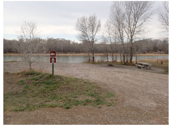
Lowry Bridge Recreation Site

The Lewistown Field Office (LFO) has been fortunate to have campground hosts at Lowry Bridge Recreation Site for many years. Because permitted fishing outfitters utilize the site for river access, permit revenue is utilized to reimburse the hosts. Through the assistance of the camp hosts, the LFO provides the public with a clean, safe, and enjoyable site for camping, floating, and commercial fishing opportunities. In FY22, the Field Office utilized SRP revenue for camp host living expenses.