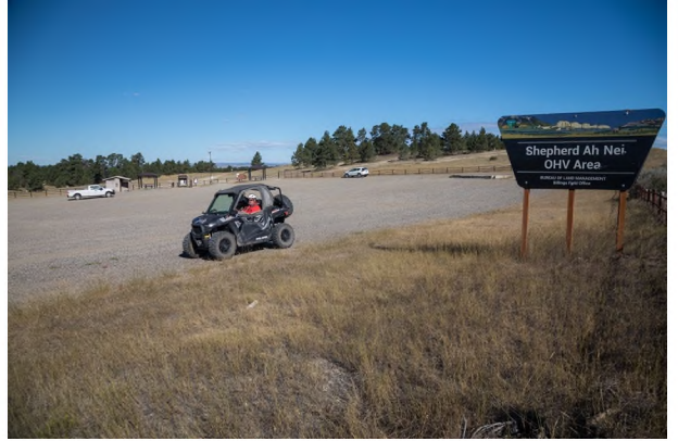
UTV Monitoring Site

Shepherd OHV is a popular destination for off-highway vehicle enthusiasts near Billings, Montana's largest city. Due to its high volume of visitors, regular monitoring and upkeep are essential. The 1232 funds were utilized to purchase fuel for the BLM's utility terrain vehicle and to stock the on-site latrine with maintenance supplies and toilet paper. Over 37,000 OHV enthusiasts, armed with their 50-inch or smaller vehicles including four-wheelers, motorcycles, and small side-by-sides, flock to Shepherd OHV Recreation Area to explore its picturesque trails winding through the Ponderosa Pine forest.