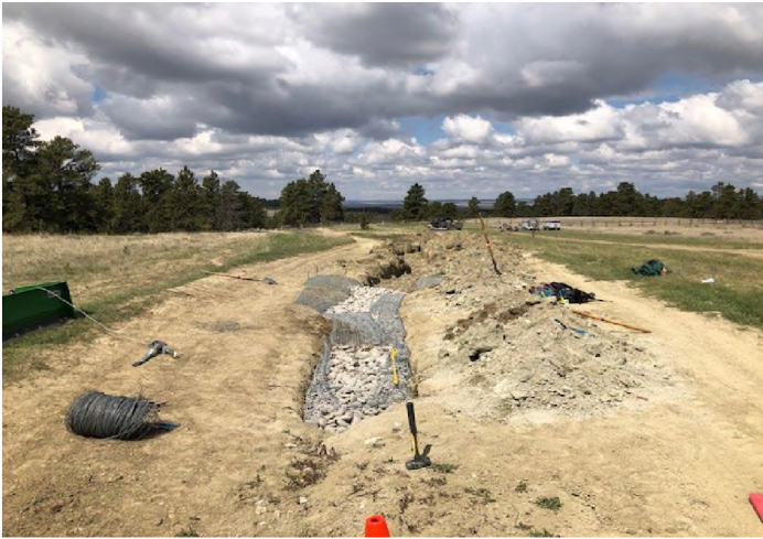
Gabion construction to fill in ruts on a trail.