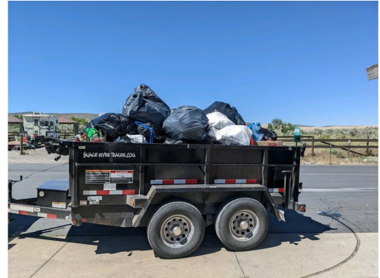
Garbage collection at site

The Egin Lakes Campground located eight miles to the west from St. Anthony, ID. The developed campground offers a potable water system, RV dump station and 48 improved camp units, including electrical service. There is also a day use area and horse trailer parking area.