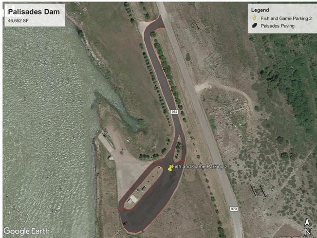
Palisades Dam Boat Access Asphalt Project