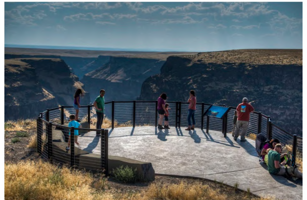
Families visiting the Bruneau Canyon Overlook

The Bruneau Canyon Overlook sits at the edge of the Bruneau Canyon adjacent to the Bruneau-Jarbidge Rivers Wilderness Area. It provides ADA access to the canyon rim with two different paved paths and viewing platforms. Visitors can look down into the deep canyon and see the stretch of rapids called Five Mile Rapids. The site also has a vault restroom, some dirt trails, interpretive panels, stone benches, a safety fence along the rim, and a fence around the site itself.