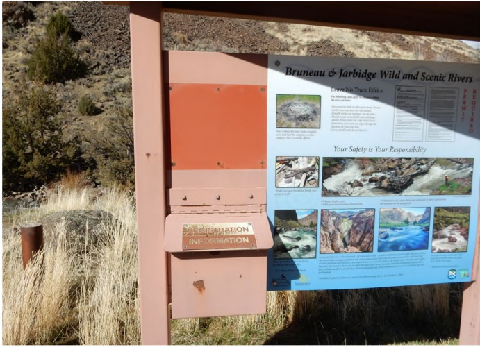
Jarbidge River Launch Kiosk

Purchase supplies for continued monitoring of Wild & Scenic Rivers.