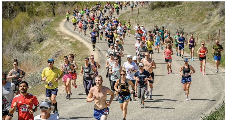
Race to Robie Creek Special Recreation Permit

In 2022, Four Rivers Field Office competitive special recreation permits (SRPs) rebounded to near pre-Covid levels, but most with lower participation. These annual events will return to their former numbers in the future. Four Rivers administers about 12-15 competitive SRPs annually which account for the majority of 1232 fees collected each year. About half of these permits are trail running races on the Ridge to Rivers Trail System in the Boise Foothills.