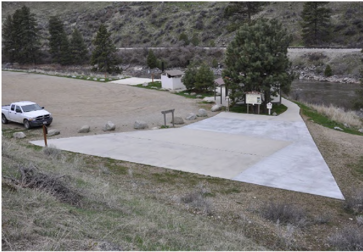
Beehive Bend on the Payette River