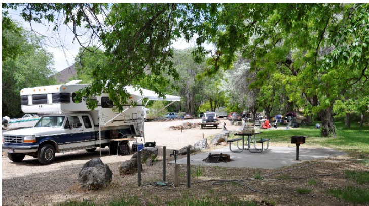
Campers at Steck Park Campground

Steck Park Campground is on Brownlee Reservoir in the Hells Canyon area. The campground has 44 sites, two boat launch ramps, potable water, an RV dump station, and a fish cleaning station. Fee dollars were used to operate and maintain the site. There is a proposal to transfer Steck Park Campground management to Idaho Power in 2024 as part of Federal Energy Regulatory Commission relicensing.