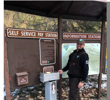
Park Ranger Checking the Fee Box

A major portion of annual fee revenues go towards completely or partially funding permanent, seasonal, and volunteer staff positions for the recreation program. In addition to funding program labor, these funds are spent on supplies, materials, and equipment that support operations and maintenance of developed infrastructure and assets. Coeur d'Alene sites also provide public interpretation and guidance of rules and regulations.