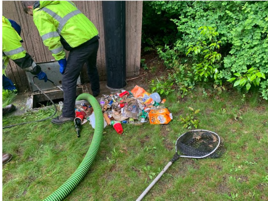
Underground Vault Sewage Collection

Annual fee dollars funded two major service contracts that supported the Recreation Program. The contractors performed human health and safety tasks by keeping developed facilities clean and orderly. Janitorial and lawn services are provided at Blackwell Island, Mineral Ridge Scenic Area, Beauty Bay Recreation Site, and the Wallace Forest Conservation Area. The Field Office also services twenty-seven 1000-gal vault toilets and one 3000-gal RV dump station at Huckleberry.