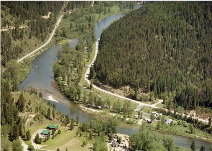
Arial Photo of Huckleberry Campground