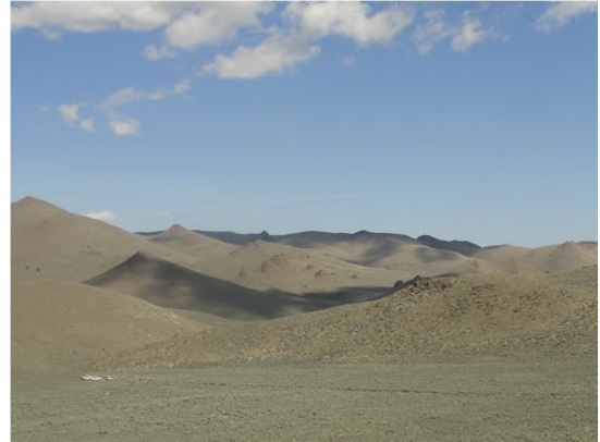
Perjue Canyon implementation site

The majority of Bruneau Field Office's 1232 funds are generated through several annual desert motorcycle races. Each race spans nearly 100 miles drawing in hundreds of competitors from across the West.