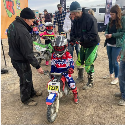
Pre-check processing for youth rider

The majority of Bruneau Field Office's 1232 funds are generated through several annual desert motorcycle races. Each race spans nearly 100 miles drawing in hundreds of competitors from across the West.