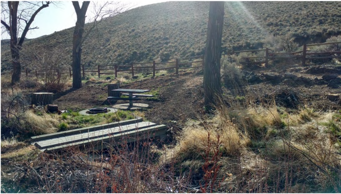
Poison Creek Rec. Site harazard tree removal

The majority of the FY 23 funds will be carried over for several years and set aside for fencing upgrades and hazard tree removal at the Poison Creek Recreational site.