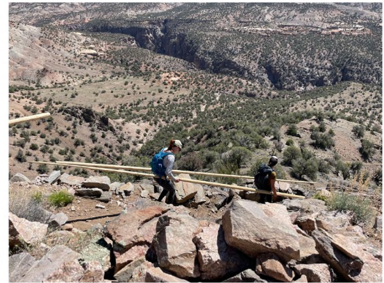
Volunteers hike tipi poles down Ute Trail

Rangers oriented visitors, helped groups select camps, ensured private and commercial compliance, and maintained campsites and facilities. Kiosk inserts were upgraded at trailheads. A new method of paying fees was introduced. A convex mirror was installed on Chukar Road, enhancing the safety of visitors. Ute Park pit toilet was rehabbed, providing a crucial amenity for visitors. Finally, new tipi poles and canvas were installed at the BLM Ranger Station, utilized for river patrols.