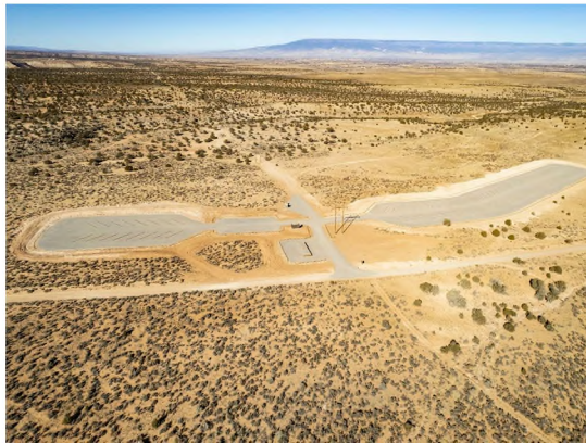
Aerial view of finished staging area

Construction was completed on new infrastructure to support recreation needs, as well as commercial events. This accessible area tailors towards big groups of visitors and is responsive to local underserved communities' needs (those who might prefer to recreate in big groups close to home and tailgate with family/friends, as well as ride/walk/run fun trails). Seeding naturalized the post-construction footprint, new interpretive kiosks were installed, and traffic counter was placed at the site.