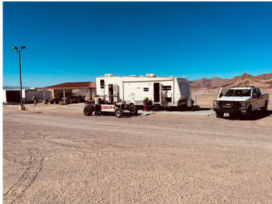
Dumont Dunes Incident Command Post Set-up

Barstow Field Office manages Dumont Dunes which is a very well visited area containing large sand dunes that extends 30 miles in length. Visitors enjoy open desert riding on dune buggies, ATV's, UTV's. Camping in large recreational vehicles is also popular. Law enforcement, fire crew, and visitor service staff assist visitors on busy holiday weekends with up to 25,000 visitors sometimes. The staff is available for questions, to provide support, and emergency medical assistance if needed.