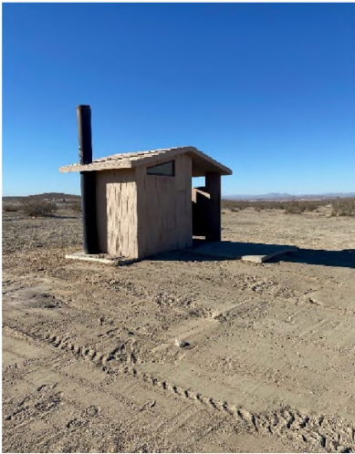
Photo of One Vault Toilet at Stoddard Valley