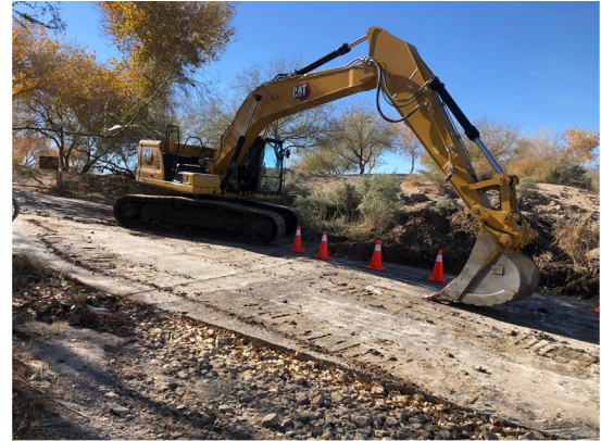
Excavator on Boat Ramp

Yuma Field Office (YFO) continued to enhance existing amenities at recreation sites and replaced worn out or no longer serviceable items.