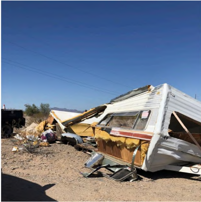
Abandoned Recreational Vehicles

Recreation fee dollars were utilized to help fund the cleanup of abandoned RVs, motor vehicles and assorted refuse left behind by visitors to public lands.