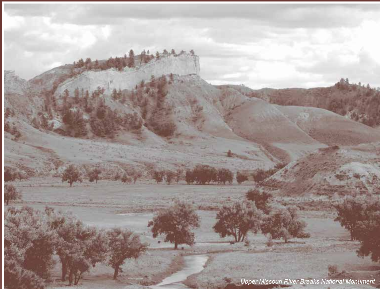
Upper Missouri River Breaks National Monument