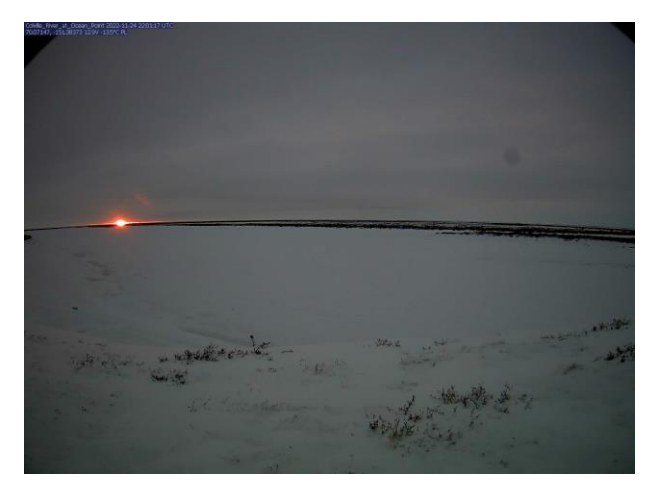
This November 24, 2022 photo depicts the last transmitted image of river ice conditions along the Colville River near Ocean Point.

Water Stage Height (Stage 2): 7.65' (above MSL) Water Temp (Temp 1): 31.8°F Air Temp (1-week high): 35.06°F Air Temp (1-week low): -4.0°F Air Temp (1-week avg): 15.53°F