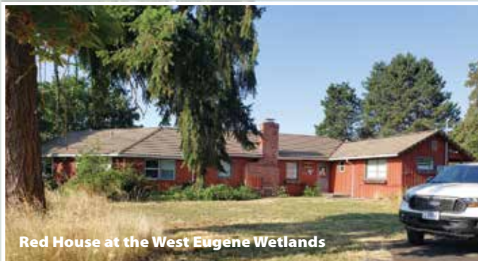
Red House at the West Eugene Wetlands