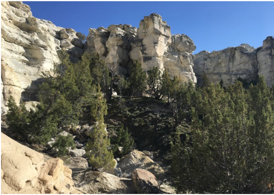
Castle Garden recreation site.

Worland BLM plans on obtaining a cleaning contract for the Duck Swamp Recreation area ($13,000). Continue our agreement with the US Forest Service to assist with the Climbing Ranger ($5,400). The additional ($9,000) expenditures will be to fund labor to monitor and maintain Special Recreation Permits, recreation areas, trail systems, and waters.