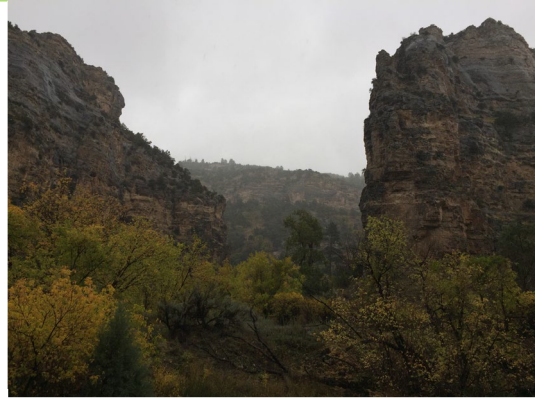
Canyon Creek climbing area

Rock climbing is becoming a popular outdoor activity in the Ten Sleep Canyon and surrounding areas. We have seen a significant increase in public land use in these areas in the last few years. Because of this, the Bureau of Land Management Worland Field Office has decided to partner with the United States forest service to assist with financing a Rock Climbing Ranger. This Ranger will ensure a continued positive outdoor recreation experience for the public while ensuring public safety.