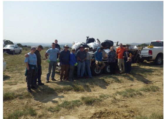
RSFO Staff with NPLD Volunteers

The RSFO only collects Recreation Fee Funds from our Special Recreation Permits and pass sales. We have no fee sites. We have had full turnover in the recreation staff and saved our money this year for planned projects in FY 2022 and FY 2023.