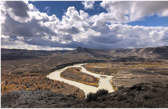
The Green River from the Wilkins Peak Bike Trails

The RSFO is planning several recreation infrastructure developments during FY22 and FY23. These include developing North Table Rock Camp Area into a formal campground, developing a second staging area for the Killpecker Sand Dunes Open Play Area, and improving the Killpecker Sand Dunes and Wind River Front Campgrounds. Improvements at the campgrounds will include replacing damaged fire rings and picnic tables, adding shade structures where necessary, and adding a few more sites at the Wind River Front. The RSFO will also expand trails and develop a second parking area at the Wilkins Peak Bike Trails. Funds will also be directed to increase Law Enforcement activities at our recreation sites, including enforcing stay limits at the Wind River Front and safety rules at the Killpecker Sand Dunes Open Play Area.