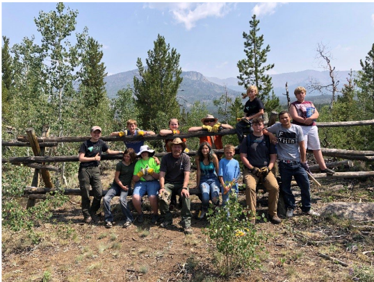
ORP with local CORE Youth