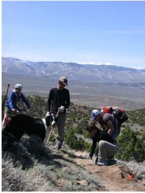
Trail work at Johnny Behind the Rocks

The following activities are planned for Fiscal Year 2022: