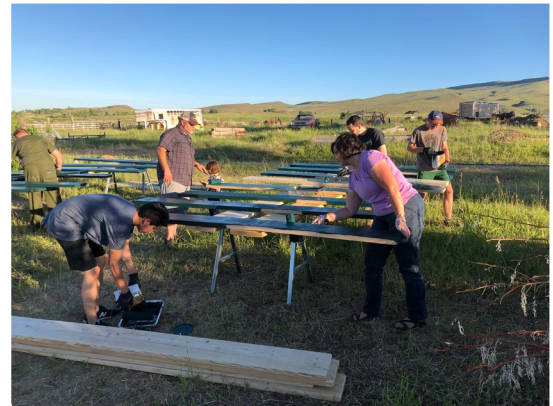
Work on Picnic Table Boards

The Lander Field Office utilized fee program funding for materials and labor costs to refurbish the picnic tables at Cottonwood Campground--a fee site in the Lander Field Office. BLM partnered with a local Boy Scout Troop to replace weathered and warped boards with new quality lumbar painted in a setting appropriate color and installed before the busy season. Handicap accessible dimensions were maintained.