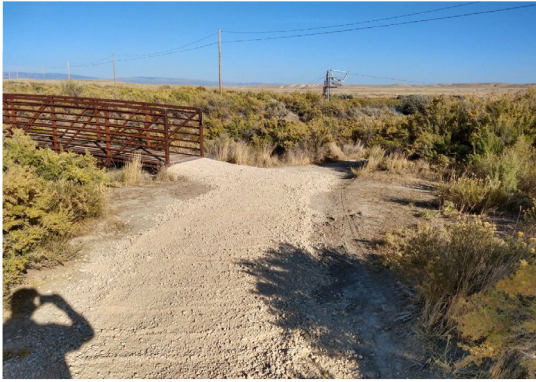
Continuing trail improvements at Blue Gulch.