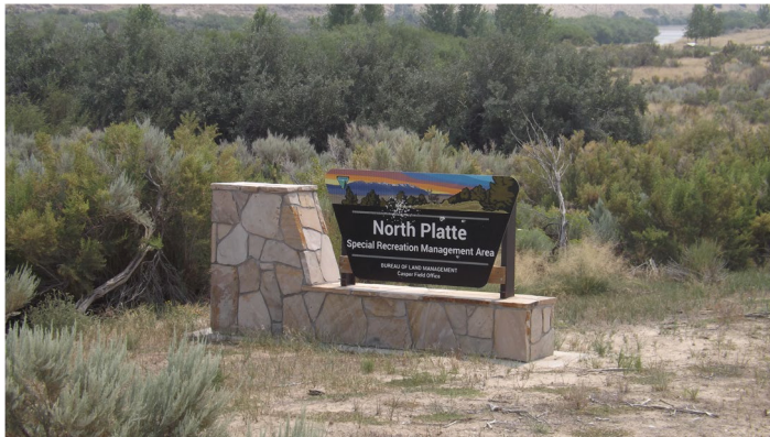
Vandalized ID sign along North Platte.

The Casper Field Office has begun the first of many installments of new signs along the North Platte SRMA, with the first installment using $2,525.87 fee program dollars for the project. This area is one of Casper's most popular fishing sections and is categorized by the WY G&F as a blue-ribbon trout stream. The last installment of signs in 2017 wasn't that long ago; however, most of the signs have been vandalized and weathered to a point where they're no longer readable, and some are no longer recognizable.