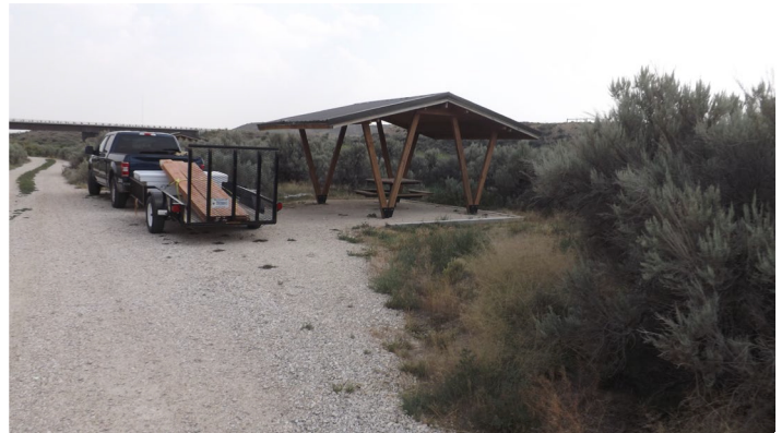
Vehicle transporting building materials to the site.

The Casper Field Office manages 17 recreation sites in remote locations throughout the CFO. To take care of all these sites and maintain a high status of quality, vehicles become very important. However, the vehicles need to be maintained to ensure staff can safely make it to and from the field. With the use of $11,982.89 of fee program funds, the CFO uses these three vehicles for staff, which allowed for more maintenance and upgrades during the 2021 Fiscal Year.