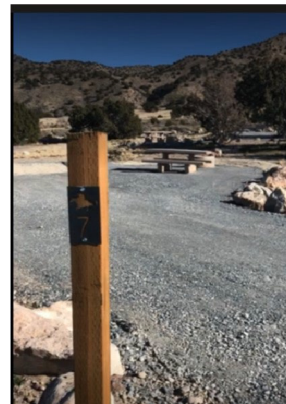
New graveled parking pads and tent pads

Completed Phase 1 Simpson Springs campground upgrades include: double-vault toilets; culinary water spigots; graveled-graded access roads; picnic tables and fire rings; graveled tent and parking pads; and pull-through sites. Also, a double-vault toilet was installed at the Simpson Springs Station along the Pony Express Trail Backcountry Byway. Total Phase 1 costs: $220,000 with $10,000 from recreation fee revenue. Phase 2 renovations will include restoring the upper loop campsites, group campsite, and equestrian campsite.