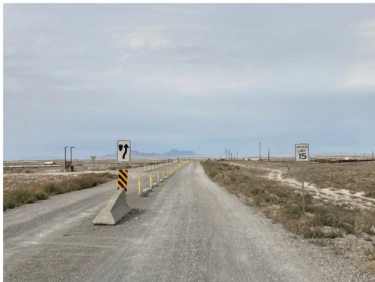
No more long lines at Knolls Fee Station

Long lines blocked the Knolls site entrance and extended onto the nearby railroad tracks on busy weekends and during organized events. Annual pass users could not pass the line, and vehicles with large trailers were unable to move around other stopped vehicles. Expansion of the entry road with lanes and a fee station off to one side now provides a separate area for users to pay entry fees. $42,000 project costs ($21,000 from Utah State Parks OHV Program grant) were spent in FY20, with an additional $7,500 in FY21.