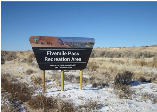
New Fivemile Pass fee site and future developments