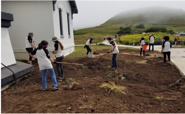
Corvallis Youth Crew; revegetation near the lighthouse