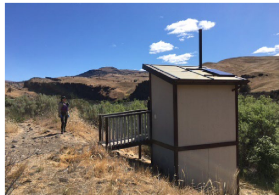
Boat-in composting toilet that was repaired

During the peak of the 2021 river season, it was discovered that five composting toilets at boat-in campsites had failing parts. This resulted in units being over capacity and required a temporary closure. The BLM quickly addressed this visitor health matter and successfully initiated an emergency service contract to address the issues and remove the compost material. The composting toilets were reopened following the repair.