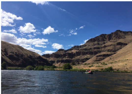
River Ranger Float

Sixty-four new site identification signs were installed throughout the river corridor. All kiosks in BLM-managed recreation sites were updated to provide a welcoming look that showcases important regulations and interpretive messaging about the river and other recreation sites.