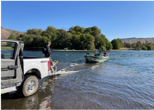
BLM jetboat being launched on Lower Deschutes