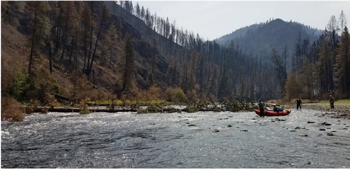
Stringer Hazard at River Mile 58 in 500 CFS Flows

In Fiscal Year 2022, deferred maintenance projects will be completed along the Snake River corridor. Two more toilet replacements are planned at the Bob Creek and Oasis recreation sites. Upon completion of these projects, future planning emphasis will be along the Wallowa & Grande Ronde River corridor. Increased patrols are planned along this Wild and Scenic River to identify hazards and coordinate Emergency Stabilization and Recovery projects.