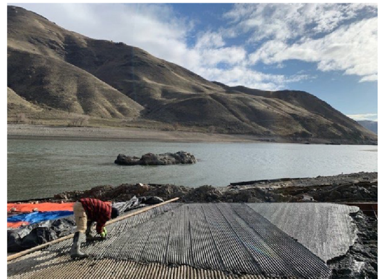
BOAT RAMP MAINTENANCE

In Fiscal Year 2021, the Baker Field Office used recreation fees to support upgrades to the boat launch and install a new boarding dock at the Spring Recreation Site on the Snake River. Throughout 2020 and 2021, recreation fees supported the labor to facilitate the planning and clearances necessary to complete the project. The field office also received a grant from the Oregon State Marine Board to replace the boarding dock.