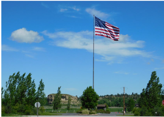
The flag pole at the entrance to PPNM

Flagpole and gate post painting (front entrance) PPNM will be completed in 2022 (spring/summer). 120'-foot flagpole, at one time, it was the highest in the State of Montana. The steel flagpole was installed in 2008 and experienced some weathering and wear and tear. Work will include prepping and painting the flagpole, various gate posts, and a vehicle barrier. It will also include installing a new cable and truck (top pulley) on the flagpole. Funding breakdown: $10,076.82 16X $ 4388.18 17X $14,465.00 Total