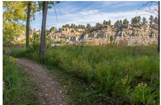
The trail next to Yellowstone River, PPNM

One mile of new trails was built at PPNM in FY 21. $3,540.42 (16X) was used to fund seasonal labor (three park rangers) to complete trail clearing, trail post-installation, and trail bench placement on the new trail system. This project expanded the trail system utilized by visitors to the National Monument and Area of Critical Environmental Concern. It also maintains the desired environmental outcomes and improves visitors' quality of experience while retaining the distinctive natural landscape features for which the site was designated.