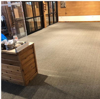
New carpet in the gift store, PPNM Interpretive center

New carpeting for the interpretive center at PPNM was partially funded through fees collected in FY17 ($7,300). Funding was obligated in FY 21, and the project finished in January 2022. This project maintains the high quality expected of BLM interpretive centers. It aligns with BLM Recreation Strategies: Connecting with Communities Strategic Focus -- Capitalize On and Protect the BLM's "Backyard to Backcountry" Recreation Brand -- by maintaining and improving facilities at a top-priority site.