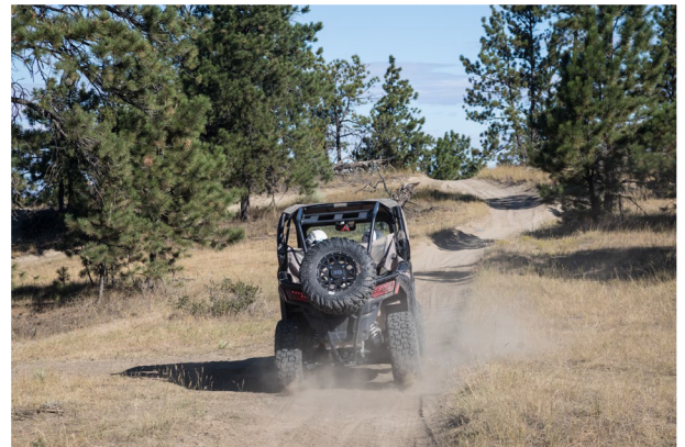
UTV on OHV Trail

We partnered with the Montana Trail Vehicle Riders Association (MTVRA) to enhance rider experience at Shepherd Ah Nei OHV Area by improving the motorized trails. MTVRA utilized grant monies to match BLM funding to improve the trail system at Shepherd Ah Nei OHV Area.