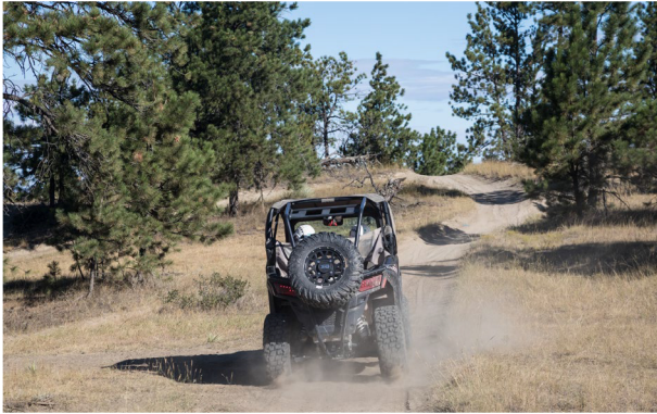
UTV out on trails

The BLM has partnered again with MTVRA to apply for additional grant funding. We are utilizing funding in 2022 to perform further maintenance on trails in the OHV Area. Carryover funds will go to help pay for the contractor.