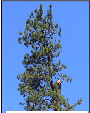
Hazard Tree Removal