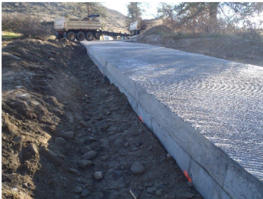
Slate Creek Boat Ramp Under Construction

The Cottonwood Field Office manages multiple recreation sites along the Lower Salmon River. Many of these sites have boat ramps. In FY 21, the office used 1232 funds to leverage $413,000 of 1653 funding for three boat ramp improvement contracts at Lucile, Shorts Ba,r and Hammer Creek Recreation Sites. $39,999.97of 1232 funds was used to leverage $187,074.88 of 1653 funding for the Pine Bar Recreation Site Asphalt Road Improvement project.