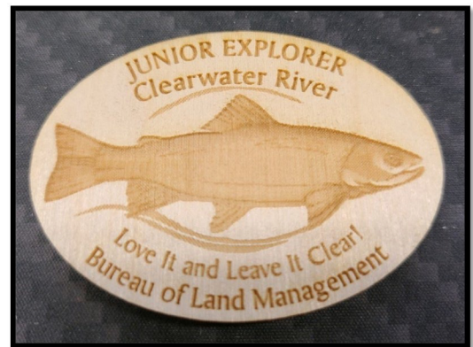
Clearwater River Explorer Badge

The Cottonwood Field Office manages recreation sites along the Clearwater River. Funding was used for labor costs for permanent full-time and seasonal Park Rangers who perform maintenance at recreation sites. They had hazardous trees removed, trees trimmed at Pink House and Harpers Bend Recreation Sites, purchased two interpretive panels highlighting the Lewis and Clark National Historic Trail at McKay's Bend Recreation Site and purchased Junior Ranger Badges for the Discover the Clearwater River Activity Book.