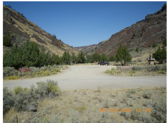
Jarbidge River Launch Site

The Jarbidge River Launch Site provides river access for whitewater boaters and anglers. The site includes boat ramps, picnic table, fire rings, and a vault restroom. There is also a foot trail that runs along the river's edge for approximately one mile and goes up out of the canyon. River users are required to fill out the free, self-registration permits located at the kiosk.