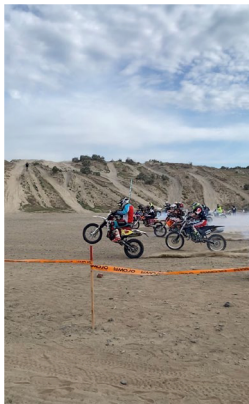
Annual motocross race

For the past several years the Magic Valley Motocross has held a desert motocross race in the Jarbidge Office in May. It is held in the Deadman Special Recreation Management Area or the Yahoo Special Recreation Management Area. There are different divisions with youth riders up to pro riders. Spectators can observe the race from designated areas.