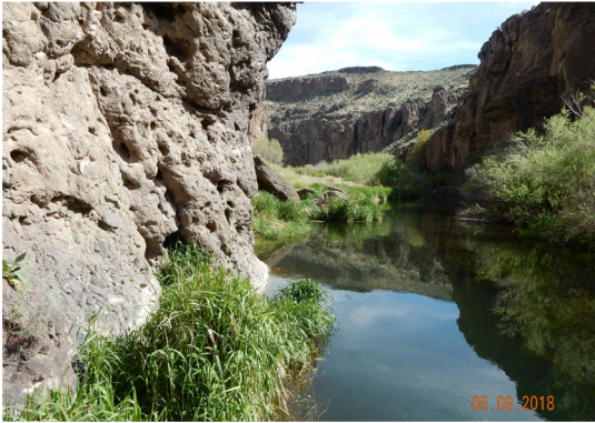
Salmon Falls Creek