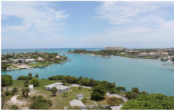
Aerial view of JILONA