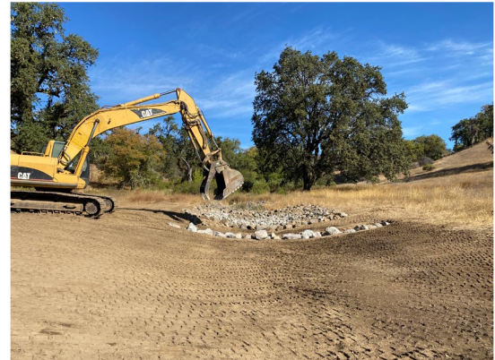
Eight Mile Valley restoration construction.

BLM has used carryover recreation fee revenue ($1,689.34) in FY19 and FY20 to rehabilitate the Eight Mile Valley Meadow. Eight Mile Valley meadow is within the South Cow Mountain and provides a habitat for migratory birds and sensitive species. The rehabilitation of this meadow has improved wildlife/wildflower viewing, hunting, and hiking and improved the nature experience for OHV users on nearby trails. Project partners: California State Parks OHMVR grant program and California Native Plant Society.