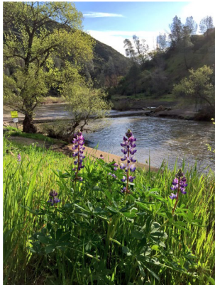
View from Redbud Trail.

The Berryessa Snow Mountain National Monument attracts visitors interested in a range of activities from camping, horseback riding, off-highway vehicles (OHV), and much more. Recreation fee expenditures ($5,028.82 part of carryover funds from FY 2016, FY 2017, and FY 2020) supported developing, printing, and distributing a brochure and map showcasing the Berryessa Snow Mountain National Monument and its facilities. Project partners: Mendocino National Forest.