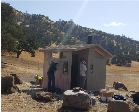
Partners making facility improvements.