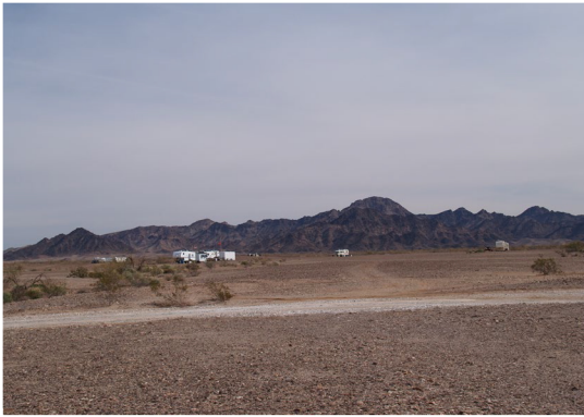
Mule Mountain Long Term Visitor Area