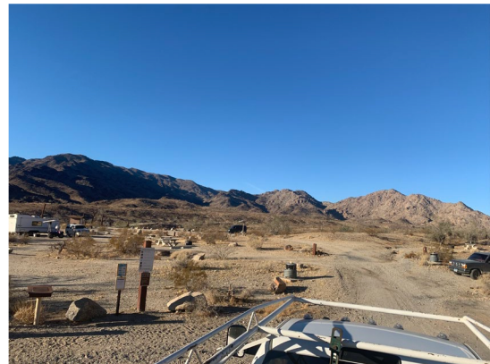
Corn Springs Campground

Recreation Fee dollars were utilized to maintain, manage, and patrol four developed campgrounds. Three campgrounds have onsite volunteer campground hosts, water systems, vault toilets, and dump stations.