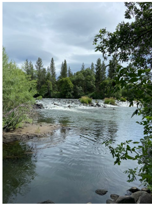
Stunning View from Pit River Campground

In NE California, the Pit River Campground and Day Use Area is just steps from the adjacent Pit River. Recreation opportunities include swimming, fishing from the pier, fly fishing, picnicking, birding, kayaking, and river rafting. The eight campsites have fire rings, tables, and BBQs and the campground offers two wheelchair-accessible restrooms. Collections ($5,600) from recreation use fees and interagency passes were used for routine maintenance, law enforcement, and overhead costs.