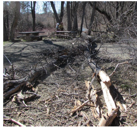
BLM Fire Crew Removing Hazardous Trees

In FY2021, the BLM forester and the fire crew completed hazardous tree removal in the Pit River Campground. The dead and dying trees posed a threat to the safety of visitors in the campground and day-use areas. In collaboration with the Pit River Tribe, the downed trees were efficiently used for firewood. Recreation use fees, individual recreation fees, and interagency pass made this work possible.