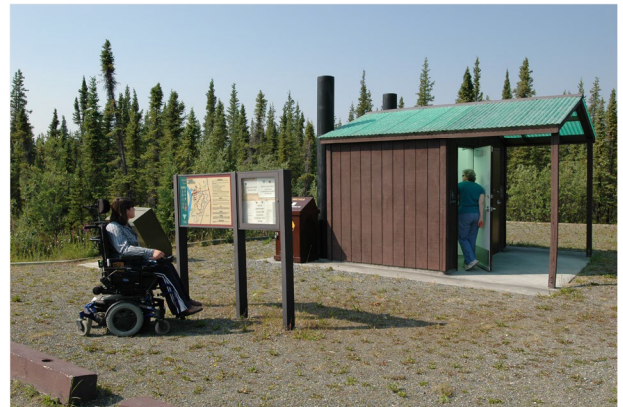
Janitorial and Outhouse Pumping Contracts

During FY2021, Glennallen Field Office (GFO) maintained a janitorial contract to keep vault toilet facilities cleaned and sanitized. The field office utilized this local contractor to pump vault toilets at four developed campgrounds and two waysides within GFO. Purchased supplies such as trash bags, hand sanitizer, safety equipment, and toilet paper were bought. Staff kept facilities clean and functional for the enjoyment of visitors.