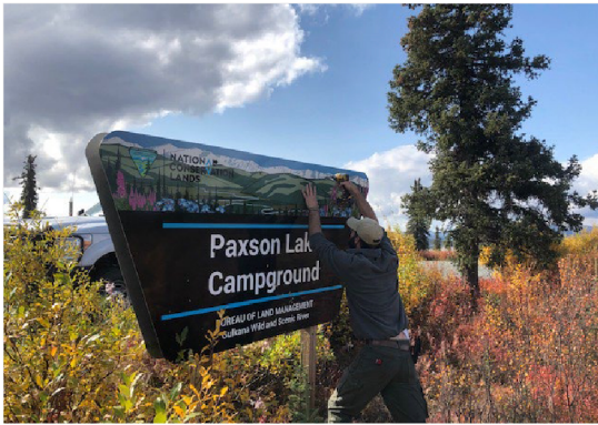
New campground sign installation