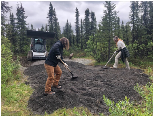
Seasonals raking out and level existing campsite

In the fiscal year (FY) 2021, seasonal staff leveled existing campsites within the Paxson Lake Campground by placing additional gravel and resetting benches and picnic tables within sites needing improvements. The BLM accomplished this by spreading gravel base with a skid steer, dump truck, and mini compactor. This allowed visitors to safely access sites and accommodate additional parking and improved camping activities