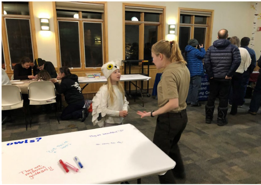
Nature-based programming at CCSC

CCSC plans to publish its Federal Lands Recreation Enhancement Act Business Plan in FY2022. The site will implement the new plan and utilize prior-year recreation fees as the facility reopens. These recreation fees include operational labor of education technicians who will provide a diversity of enhanced amenity interpretive programs such as hikes, talks, distance learning, evening programs, and workshops. CCSC selected priority projects from program needs identified through management and public involvement, focusing on visitor engagement, interpretation, and education. CCSC will incorporate recreation.gov for fee collection in FY2022.