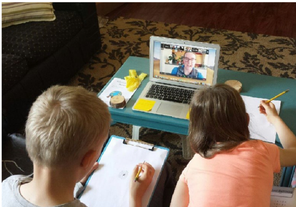
Students study nature virtually with CCSC Educator

Campbell Creek Science Center (CCSC) provided 203 virtual programs, reaching 4,718 people (2,545 youth and 2,006 adults) in fiscal year (FY) 2021. Participants attended from 36 Alaska communities, 46 communities in 22 states of the United States, and 3 international countries. Topics covered the diversity of BLM's multiple use and sustained yield mission. Programs included Alaska Explorer for K-6th grade at home learners, Fireside Chats, naturalist talks, and Nature Journaling. This is a milestone achievement in virtual learning, a new field for BLM.