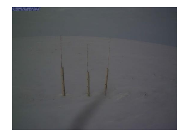
Photo taken 11/23/21 at Station H (Ocean Point) showing variability in snow depth cover: