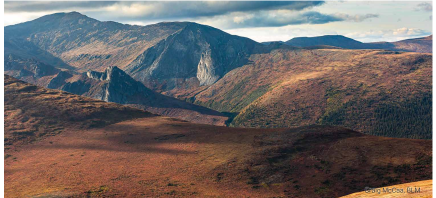
Craig McCaa, BLM

View a slice of interior Alaska by visiting the 2.2 million acres of BLM-managed public lands that stretch from Fairbanks to the Yukon River at Circle City. Hike, bike, ski, snowmachine, paddle, or drive through the spruce and birch forests and mountain summits of Steese National Conservation Area and White Mountains National Recreation Area. The region's low, rounded mountain ranges and clear-water river valleys provide important habitat for the Fortymile caribou herd and many other species.