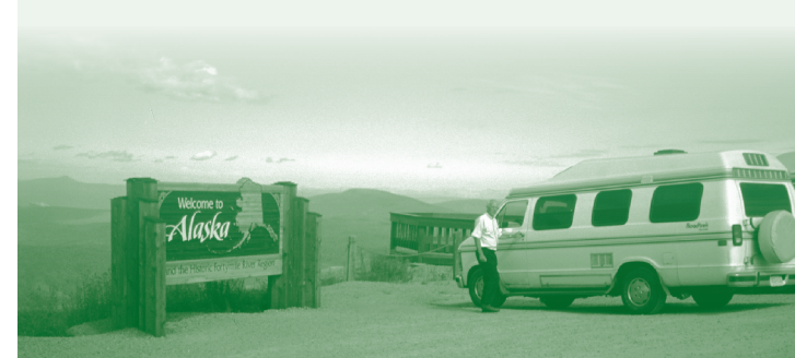
Davis Dome Wayside, Top of the World Highway

Elevation 4,127 ft (1,258 m). United States and Canada customs offices are open only during the summer months, usually from May 15 to September 15. Dates can vary so call ahead (907-774-2252) to be sure. Hours are from 8 a.m. to 8 p.m. Alaska time. The Top of the World Highway continues to historic Dawson City and the Klondike gold fields.