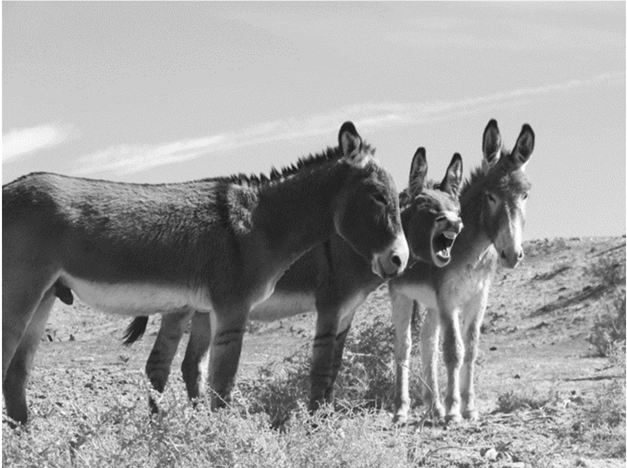
Wild Burros photographed during a site visit early in 2020.