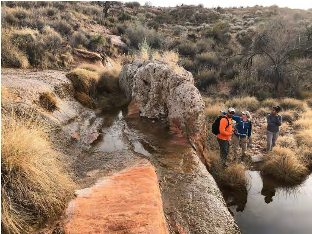
Red Rock Springs Monitoring Site Visit by USGS and BLM Resource Staff

Researchers with the USGS Nevada Water Science Center are currently collecting and analyzing water samples from Bear Poppy, Horse, Quail, and Red Rock Springs in Gold Butte National Monument to provide information on possible sources of water to the springs. The water samples are being analyzed for major ions, trace elements, stable isotopes of hydrogen and oxygen, dissolved gasses, chlorofluorocarbons (CFCs), sulfur hexafluoride (SF 6 ), and tritium/helium. The analyses is performed at the USGS National Water Quality Lab (NWQL), the USGS Reston Stable Isotope Laboratory (RSIL), and the USGS Reston Groundwater Dating Lab (RGDL). The results of laboratory analyses will be accessible to the public from the USGS National Water Inventory System web portal.