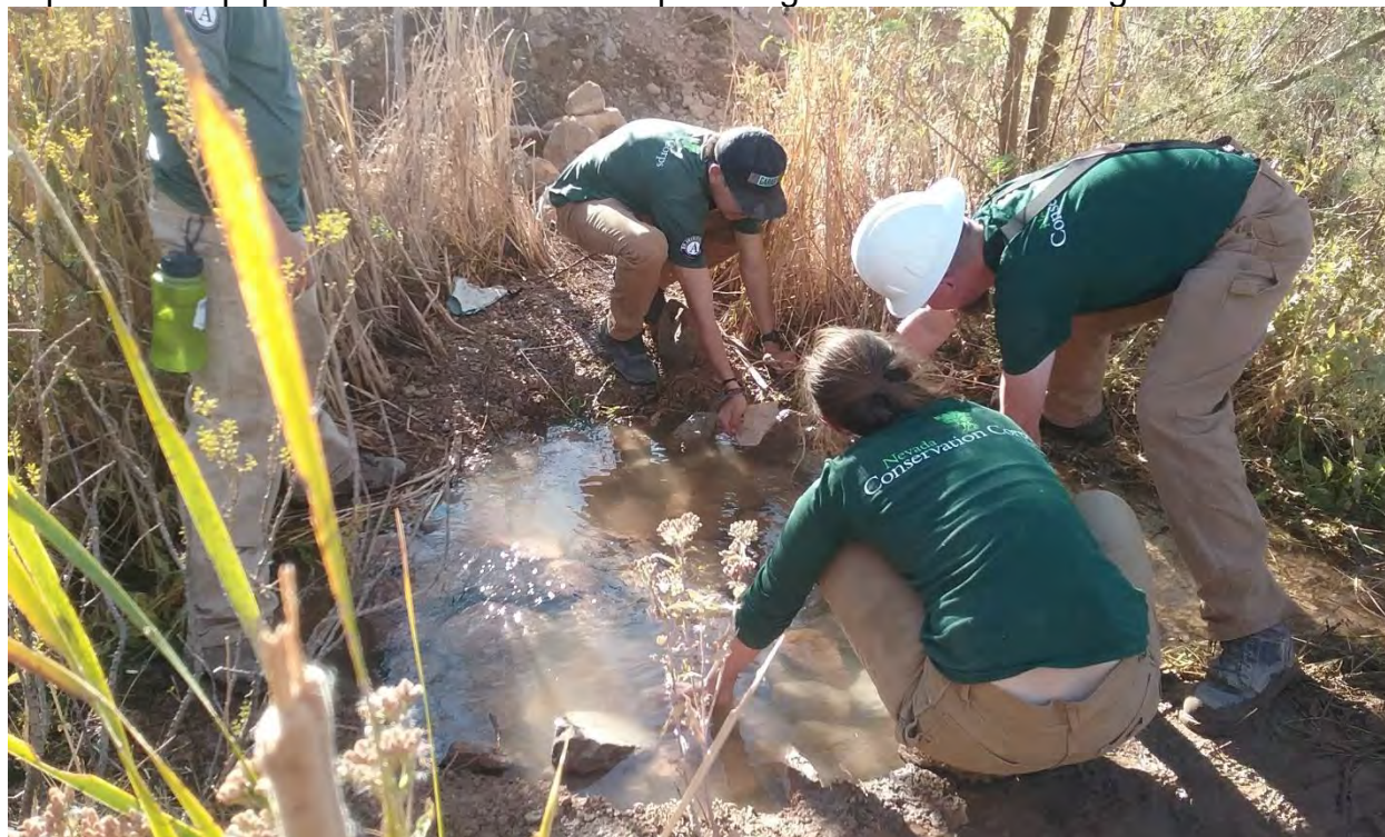
An NCC crew at Bearpaw Poppy Spring installs a relict leopard frog breeding pool.

Restoration of riparian and aquatic habitat at three springs in Gold Butte began in earnest during FY 2020 and will continue in the next four years as part of an interagency effort across southern Nevada. These projects aim to improve hydrologic conditions and riparian and aquatic habitat for a rich assemblage of species including experimental populations of the relict Leopard frog that was once thought to be extinct.