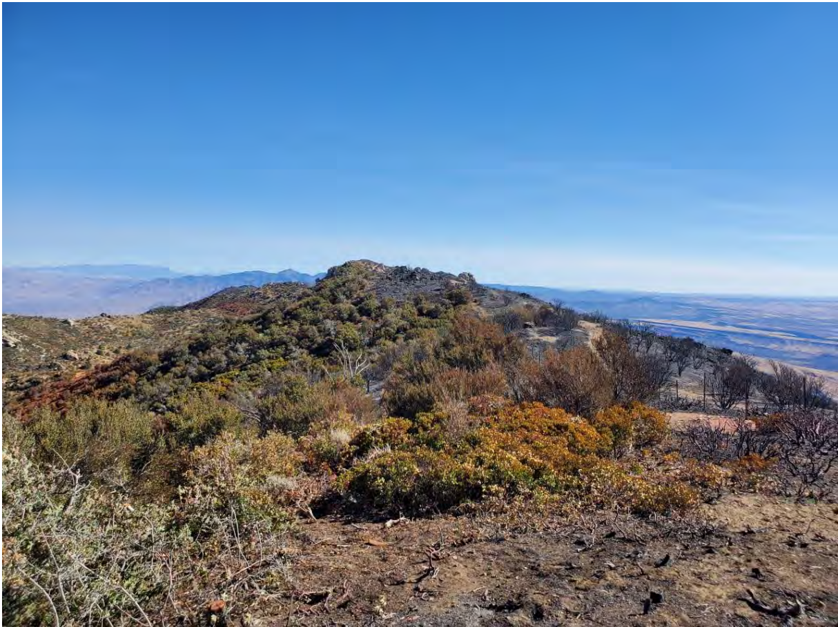
Image of the burned area from the Virgin Fire

Gold Butte experienced one major fire during the year, burning 1600 acres of the Virgin Mountains in the northeastern portion of the monument. Portions of the Virgin Mountain Instant Study Area and the Gold Butte Part C ACEC within the monument were impacted by the fire.