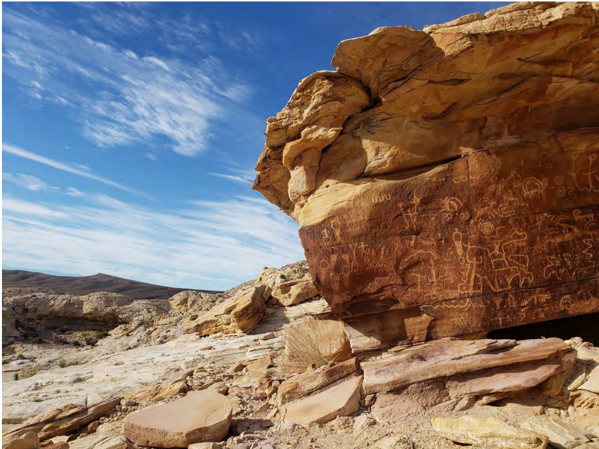
Petroglyphs at the Falling Man Complex

GBNM contains an extraordinary variety of diverse and irreplaceable historic and prehistoric cultural resources, including many sites important to the history and identity of Native Americans, and remnants of our Western mining and ranching heritage. The landscape reveals a story of thousands of years of human interaction with this harsh environment and provides a rare glimpse into the lives of Nevada's first inhabitants, the rich and varied indigenous cultures that followed, and the eventual arrival of Euro-American settlers.