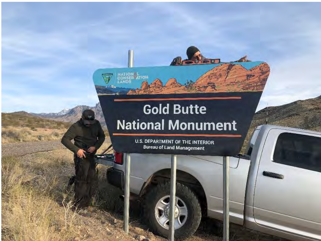
Installation of a new monument portal sign.

A road survey was conducted of the byway between Riverside Road and Whitney Pocket. Planning is ongoing for road improvements to the 21 mile stretch of the Byway to improve public access and safety.