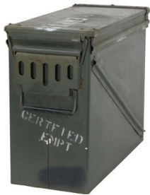
20mm Ammo Can