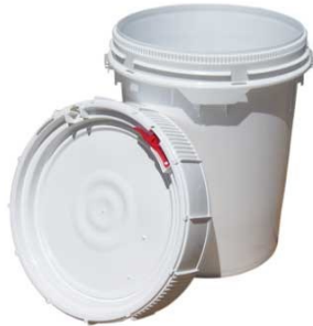
Life Latch Bucket & Lid