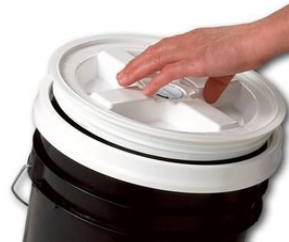
Gamma Seal Lid w/generic 5-gallon bucket