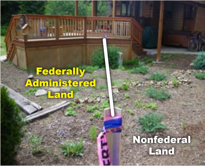
In the two situations above, structures were built on federal land by adjacent nonfederal landowners. These situations could have been prevented if the federal land managers had been proactive in management of land boundaries, such as prioritizing boundary survey operations for potential development by adjoiners. Also, if the federal land managers had contacted the cadastral survey program to officially mark and post their land, the boundaries would have been more noticeable and clear to the nonfederal landowners.