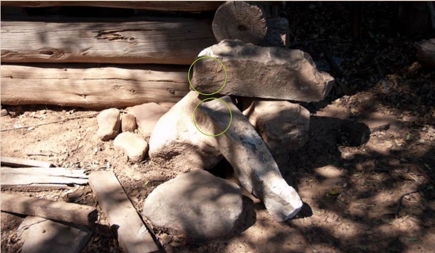
The General Land Office marked and set the above corner stones in the summer of 1882. Many years later, a nonfederal landowner did not know the actual significance of the stones and moved them while installing a driveway. The driveway encroached upon federal land. This situation could have been prevented if the managers of the federal land had been proactive in management of land boundaries, such as asking the cadastral survey program to update the corner stones bordering their land into more recognizable monuments.