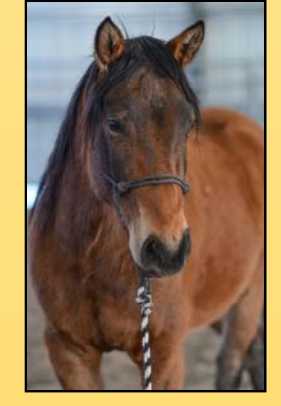
Age: 5 Sex: Gelding