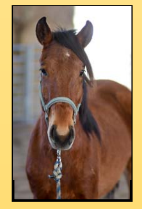
Age: 2 Sex: Gelding