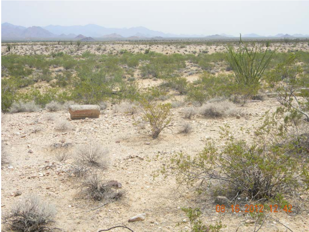
Figure 2: Lease parcel AZ020911-01/Section 18, T. 18 N., R. 17 W., G. & S. R. M.