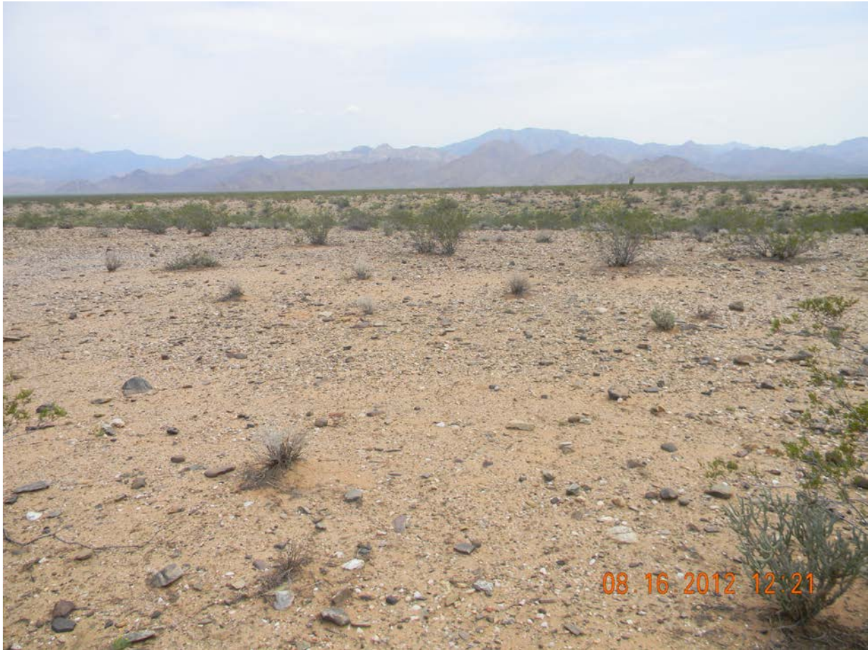
Figure 3: Lease parcel AZ020911-02/Section 30, T.19 N., R. 17 W., G. & S. R. M.

Standard lease terms, conditions, and operating procedures, as well as additional stipulations and lease notices, would apply to the proposed lease sale parcels. Standard operating procedures, as well as best management practices (BMPs) and conditions of approval (COAs) include measures to protect the environment and resources including surface and groundwater, air quality, wildlife, visual resources, cultural resources, recreation, and others as identified in the Kingman RMP.