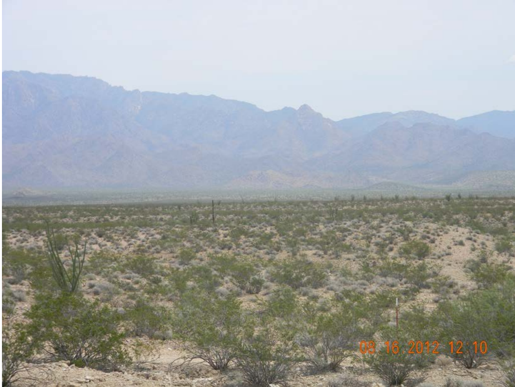
Figure 1: Lease parcel AZ020911-01/Section 6, T. 18 N., R. 17 W., G. & S. R. M.