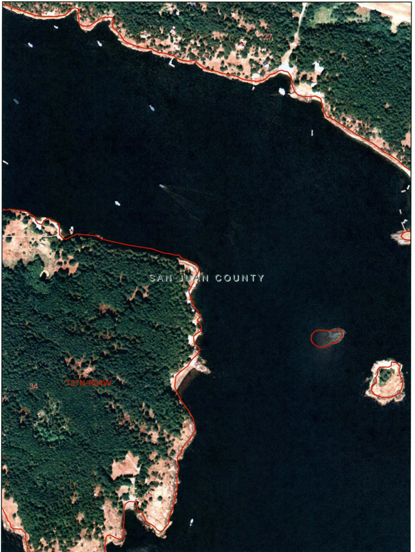
13-37, Reid Harbor Rocks, N48 39' 48.516", W123 10' 46.95" T37N, R4W, Sec 22, w 1/2, ne 1/4