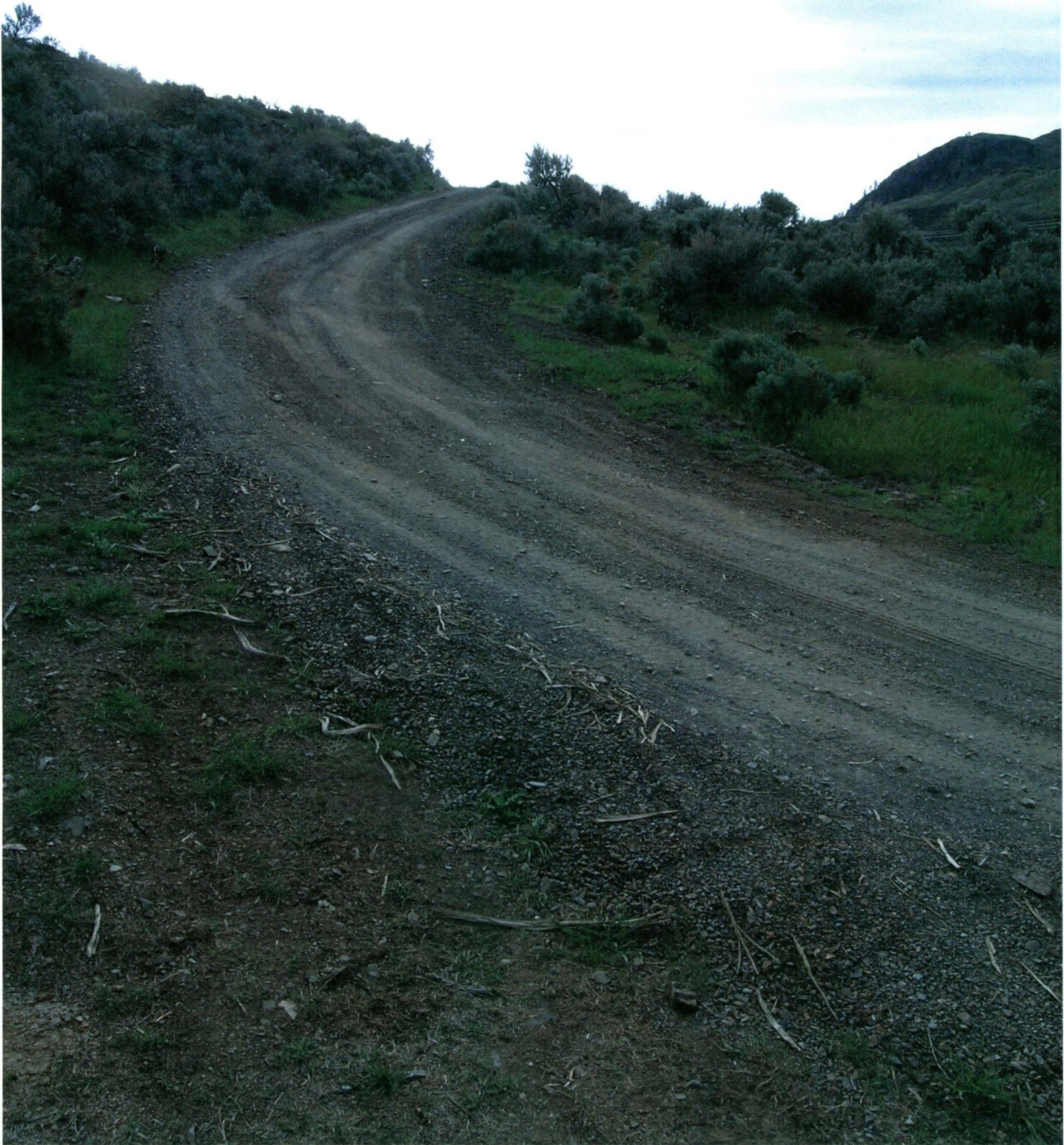
Frame 84: Similkameen Rd 01