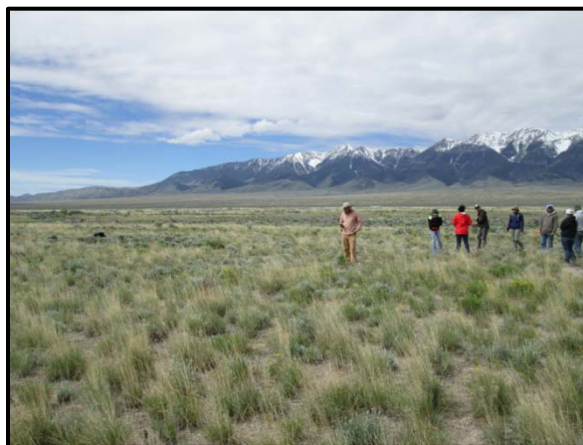
USU students preparing to record a site in the lower Birch Creek Valley.

The Upper Snake Field Office hosted the 2017 Utah State University (USU) archaeological field school directed by Dr. David Byers. The field school conducted a Class III inventory of about 3,750 acres of public land in the lower Birch Creek Valley (top photo, below) and around the Mud Lake area (bottom photo, below). The survey areas were selected as part of the joint BLM-INL Pioneer Basin project which includes terminal Pleistocene land use models developed by the INL. The inventory resulted in the discovery of 36 new sites, and 59 isolated artifacts. Many of the Native American artifacts encountered were terminal Pleistocene points exhibiting a strong northwestern Plains influence.