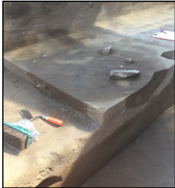
Fire hearth in a concave shaped depression. High organic matter is noted in parts of the hearth. Basalt cobble chopping tool can be seen in situ.

Fieldwork in 2017 again resulted in numerous new features discovered across the site. Many of the newly discovered features are pits. Although clearly outlined in the excavation unit floors by a change in soil color some of the features had been emptied with virtually no artifacts while others had cultural materials. For example, Western Stemmed Projectile Points, and a mandible of either a porcupine or beaver was found in one pit along with other small fragments of bone and debitage. A fire hearth was discovered that is one meter in diameter in 2015 and excavation completed 2017. High density of debitage was found in organically rich soil. A large basalt chopping tool was found in the fire hearth. The perimeter of the hearth has a white ring of calcified material around the hearth. Also, near the fire hearth an additional feature is in the process of being excavated that may be part of a structure. It contains basalt flakes and cores, mussel shell, CCS flakes, and burned soil. If this were indeed a house structure then it would date to at least 8,000 years old, if not older, making it one of the oldest in the Pacific Northwest. Excavation is on-going. This project exemplifies one of the high value multiple resources the BLM manages. Tribal and public involvement is incorporated into the project. The Cooper's Ferry project has placed the BLM in the national public and professional community spotlight. The national significance of this cultural