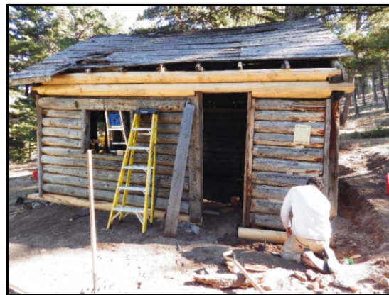
National Park Service preservationists from Ebey's Landing working on Russells Cabin at historic “Ragtown,” just west of Gilmore townsite. Work includes internal stabilization and replacement of deteriorated logs.

FY 2017 will mark the final year of successful on-going intra-agency accomplishments between the BLM, Salmon Field Office and the National Park Service, North Cascades Preservation Team in stabilizing framed and log buildings on public land at historic “Ragtown.” “Ragtown” was a semi-autonomous neighborhood occupied by itinerant miners and families down on their luck within historic Gilmore, an early-1900's mining boom town in the Upper Lemhi Valley of East-Central Idaho. NPS Historic preservationists from the Ebey's Landing headquarters began structural stabilization work at “Ragtown” in 2010, and will conclude their efforts this fiscal on the Russell cabin. These preservation measures, along with BLM partnership with the Lemhi County Historical Society and Museum to interpret the history of Gilmore, continue to provide a glimpse into Idaho's past for many visitors who come to recreate on Idaho's public lands in the Salmon Field Office.