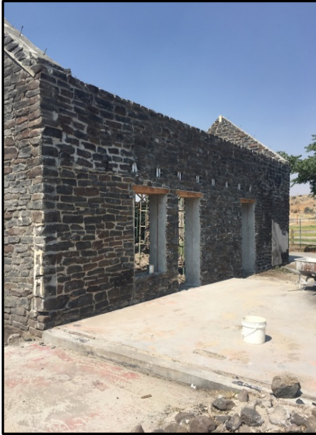
North Wall 2016, after reconstruction.

reconstruction of the south wall was completed along with hanging the floor joists for the second floor of the structure. If funding can be secured the roof will be completed in 2018.