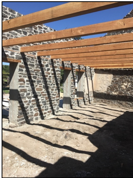
South wall from interior. Floor Joists, installed 2017.