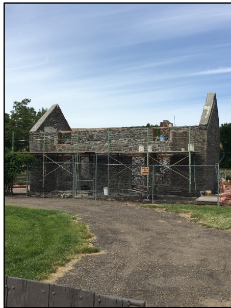
South Wall 2017, after reconstruction, near completion.

Canyon Creek Station is enjoyed and valued as being only one of two remaining stage stops on the Oregon Trail, Kelton Road and Overland Stage system. It remains a valuable piece of the fabric of Idaho's and the nation's history of early travelers, freighters and stage services. The Station is recognized in the NPS comprehensive plan for the Oregon Trail as a high potential site for its importance to convey and interpret early historic travel in the region and along the Oregon Trail. The site is eligible for listing on the National Register of Historic Places. Being located on a County road, access is perfect for interpretation and public use.