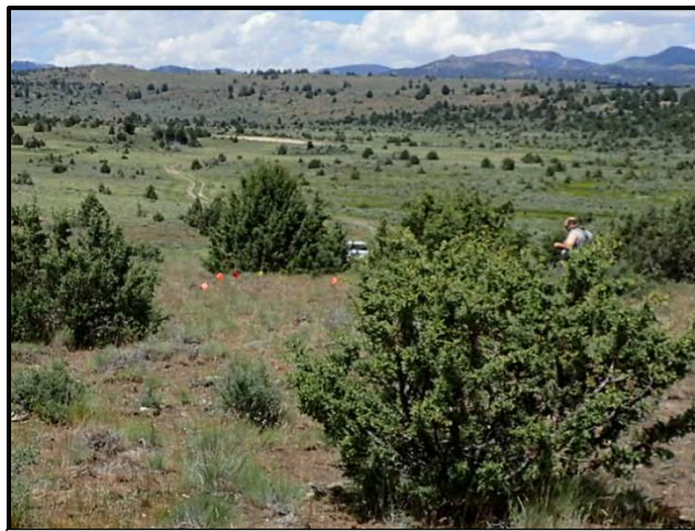
Previously recorded archaeological site being intensively monitored and rerecorded.

Seventeen sites were revisited and monitored. One site had not been visited in over 40 years, six sites had been visited post fire in 2015 (10OE11184, 10OE11493, 10OE11494, 10OE11495, 10OE11496, 10OE11497), two sites had been visited in 2014 (10OE11178, 10OE11234), and one in 2013 (10OE11254).