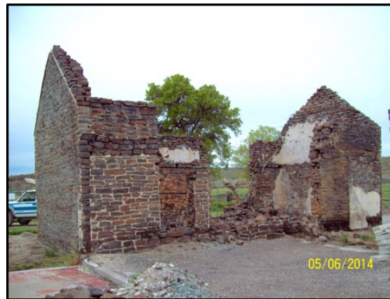
Canyon Creek Station, north wall in 2014.

Soon after acquisition, BLM began planning stabilization and restoration efforts began in the summer of 2016 based on plans and drawings created by IHT historical architect Frederick Walters. Initial work was accomplished by mason Budd Landon to stabilize and reconstruct the gable ends and the north wall of the structure was completed in 2016 through BLM funding, supported by an IHT grant. In 2017,