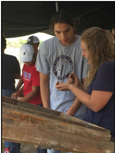
OSU graduate student explaining excavation process to visiting high school student from the Nez Perce Tribe. Other tribal students are in the background.

In addition, a Nez Perce tribal intern participated for the duration of the eight week project and contributed to all facets of the excavation so that he could learn techniques on a complex archeological site. The tribal intern was made possible through 1050 funding and a separate agreement between BLM and the Nez Perce Tribe that was initiated in 2016.