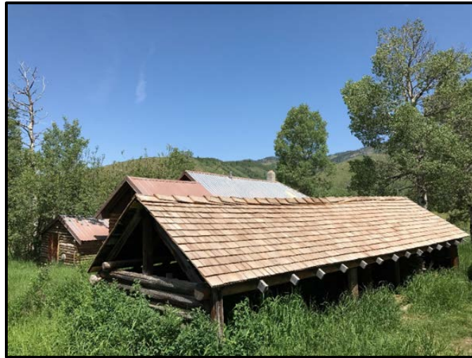
Fisher Bottom Loafing Shed, part of the Vardis Fisher family homestead. The complex is a focus of stabilization efforts for the Field Office.

The beginning of FY17 saw the completion of the Fisher Bottom Ranch complex Loafing Shed re-roof project. Members of the field office staff and fire program aided in the removal of the old roof and installation of new cedar shingles, matching the historic fabric, to help protect the building from the elements. The stabilization of the building's frame was completed in 2014 through a partnership with the Pacific Northwest Preservation Field School.