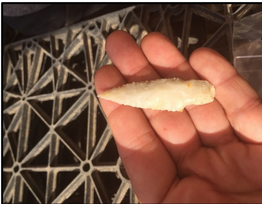
Western Stem Project Point found in situ in one of the pit features.