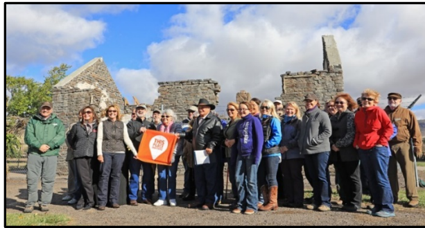
The Dedication, October 29, 2015.