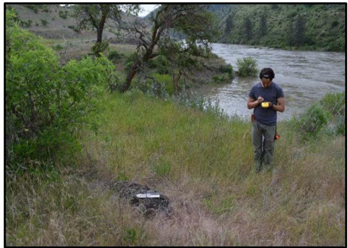
Monitoring along the Salmon River in 2017.

Continued monitoring provides information on site condition and indicates long-term trends in condition. This information provides data for making management decisions regarding site stabilization or changes in management such as limiting camping, etc. This information provides for proactive management under section 110 of the National Historic Preservation Act and the Idaho State Protocol with the State Historic Preservation Office as well as implementing actions in the Cottonwood RMP.