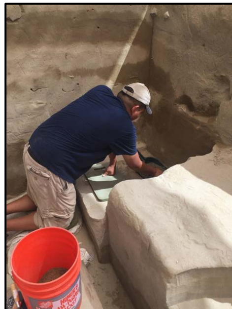
Nez Perce Tribal intern excavating circular pit feature.